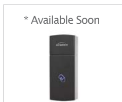
ACD-20 RFID Access