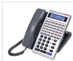
IP38-61 IP Keyphone